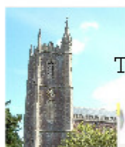
St Peter's Frampton

Buffet £6.00 per head Junior members £4.00 per head